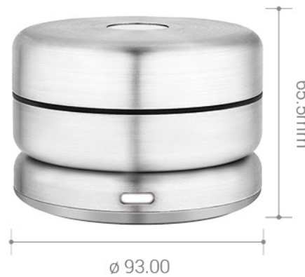
• Clium Cleaner