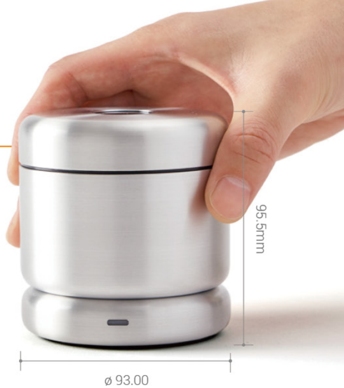
• Clium Cleaner Plus